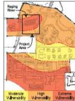
Town of Hazardville Composite Loss Map developed previously during risk assessment (see FEMA 386-2).

Losses avoided by acquisition and demolition of flood-prone structures